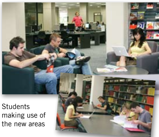
Students making use of the new areas

Client usage of all spaces and services is being monitored and reviewed as the extended building settles into its new state.